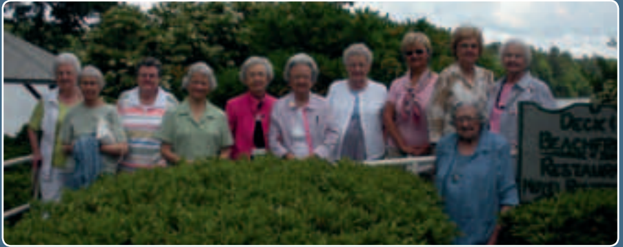
Members of the class of 1947 reunited for their spring luncheon at Lake Tiak-O'Khata in Louisville.