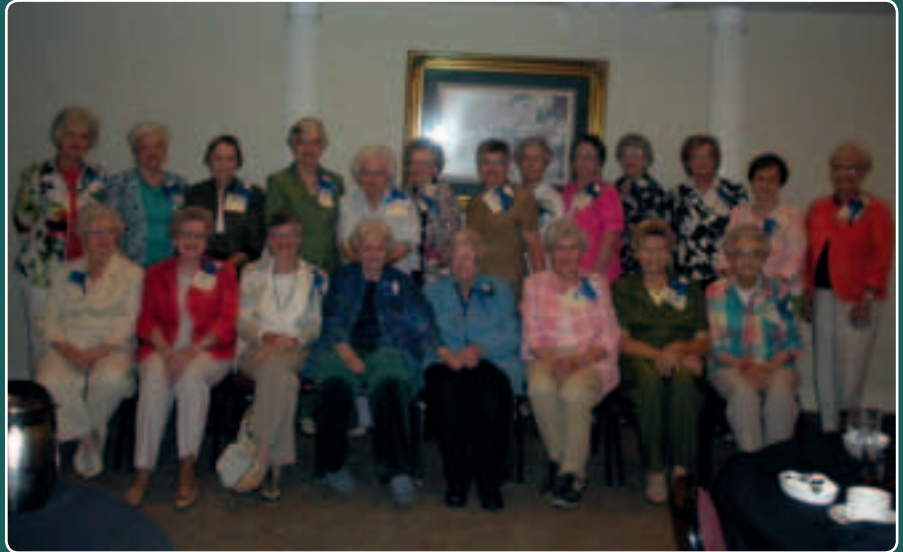
Members of the class of 1949 met for their annual luncheon at the Old Capitol Inn in Jackson during the summer.