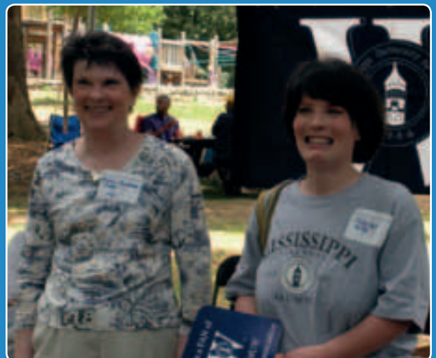
MUW alumni and friends enjoy the Mississippi Picnic in Atlanta.