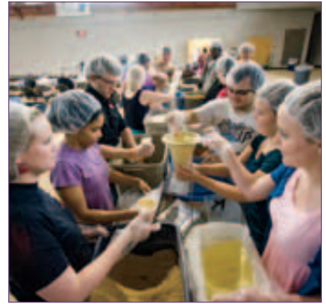
Students package meals for Stop Hunger Now, an international hunger relief organization. More than 43,000 meals were packaged between October 2009 and April 2010.